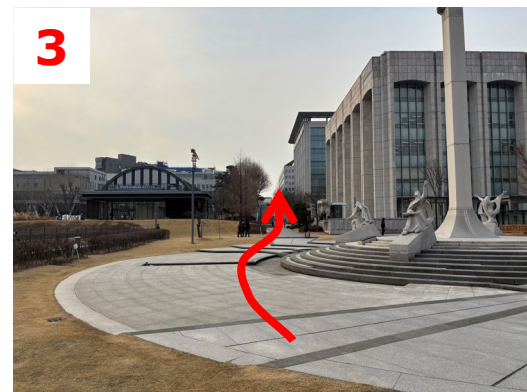
Follow the arrow