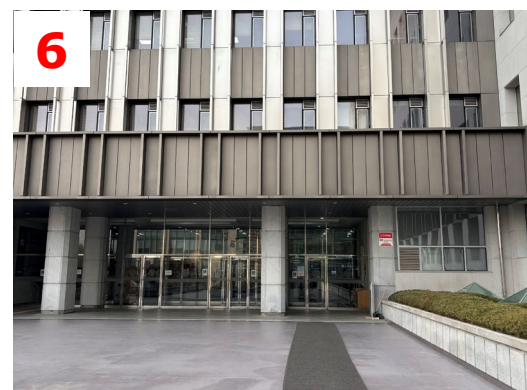
Main gate of Science Hall