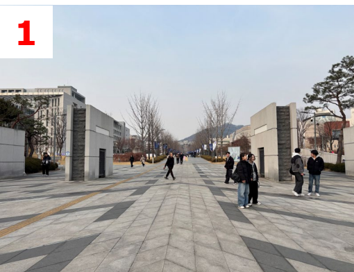
Main gate of Yonsei Go straight