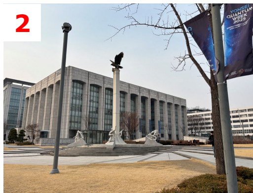
When you see the eagle, turn left